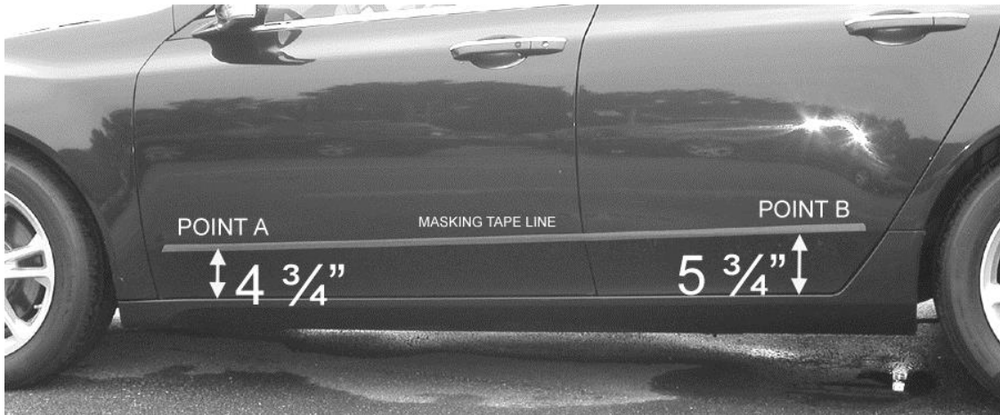
Measure up from the bottom of the doors