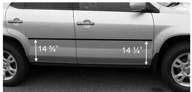
2001 – 2007 Model

IMPORTANT! When installing the Rear Door Molding with the bevel cut , start the molding approximately ¼” from the edge of where the rear door starts. When installing the Front Door Molding with the straight cut , start molding approximately 1/8” from where the edge of the door starts.