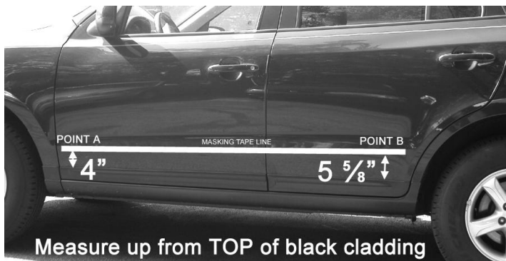
Measure up from TOP of black cladding

AFTER THE MOLDING has been installed, use a soft cloth and apply pressure along the entire length of the molding to insure proper adhesion. Remove masking tape and you will have an OEM style Custom Body Side Molding that will give you many years of protection.