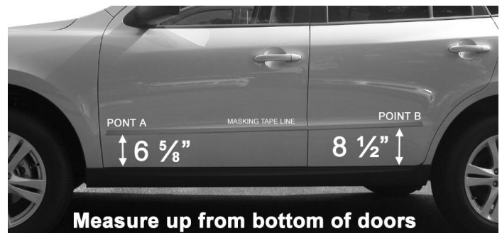
Measure up from bottom of doors