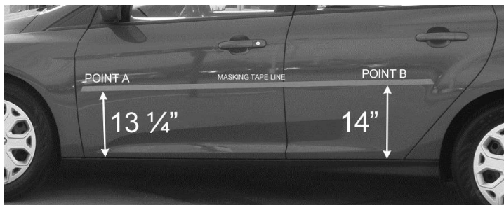
2012 & Up models: Measure up from bottom of doors.

AFTER THE MOLDING has been installed, use a soft cloth and apply pressure along the entire length of the molding to insure proper adhesion. Remove masking tape and you will have an OEM style Custom Body Side Molding that will give you many years of protection.