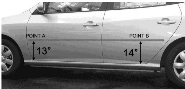
2007 - 2010 Hyundai Elantra

AFTER THE MOLDING has been installed, use a soft cloth and apply pressure along the entire length of the molding to insure proper adhesion. Remove masking tape and you will have an OEM style Custom Body Side Molding that will give you many years of protection.